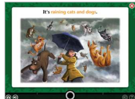
Language concepts like idioms are introduced in a fun, engaging way.