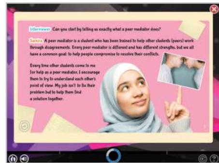
Upper-level comprehension activities include enhanced vocabulary support.