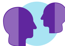
Professional learning unit sessions (live in-person or live online)