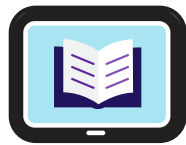
Online learning platform