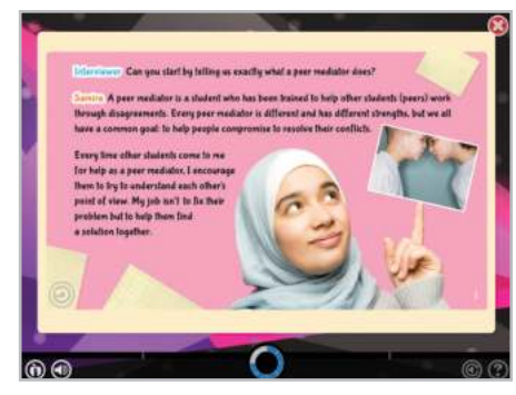
Upper-level comprehension activities include enhanced vocabulary support.