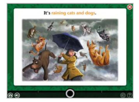
Language concepts like idioms are introduced in a fun, engaging way.